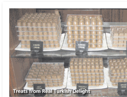
Treats from Real Turkish Delight

Craving something savoury, thankfully the next stop was lunch down the road at Mado Café. And just when we thought we couldn't possibly loosen our belts any further, out came a feast of fresh Turkish bread, hummus and a selection of salads. Luckily, after the meal, we were given a chance to digest while wandering the aisles of a large Turkish supermarket, Gima Emporium. Offering loads of rare cooking products, all