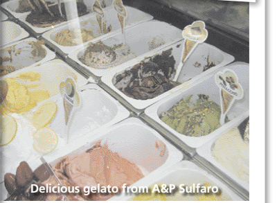
Delicious gelato from A&P Sulfaro