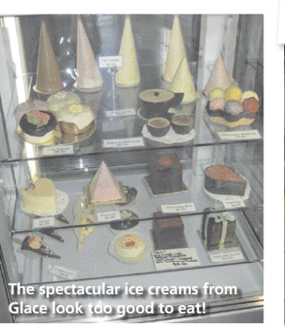
The spectacular ice creams from Glace look too good to eat!