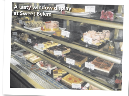
A tasty window display at Sweet Belem